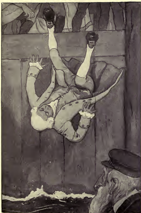
"POOR OLD BOSWELL WAS PUSHED OVERBOARD"